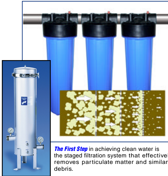
The First Step in achieving clean water is the staged filtration system that effectively removes particulate matter and similar debris.

Filtration systems provide a bacteriostatic environment and are designed to remove volatile organic chemicals, hydrogen sulfide and sulfur, herbicides, pesticides, chemical fertilizer residues, trihalomethanes and many other pollutants.